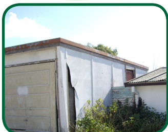
Example of asbestos garage and roof